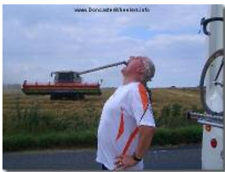
The crew needed feeding as well!

Next years championship will be held in East Yorkshire, where the club will be looking to regain their crown.