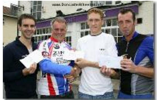
The Winners being presented with their prizes