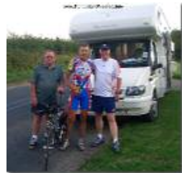
The support Crew and Rider