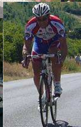
Memories of not so long ago...2010